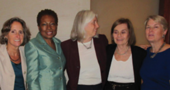
Celebrating the FDA Office of Women's Health 20th Anniversary.

Network staff and interns support pregnant workers.