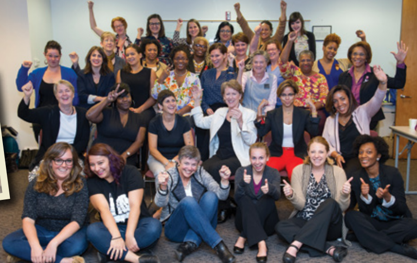
Raising Women's Voices Regional Coordinators convene in Washington, DC.